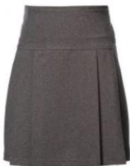
BANNER DROP PLEAT SKIRT