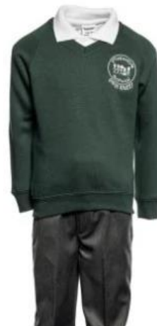
FIVEWAYS V NECK SWEATSHIRT