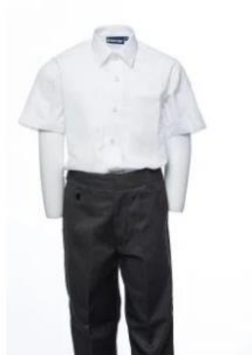
JUNIOR CLASSIC TROUSER